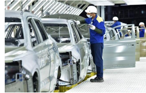
National Center for automotive