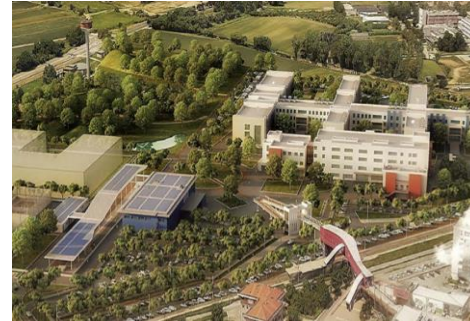
Campus Città delle Scienze Butterfly Area