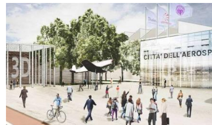
Center for Aerospace