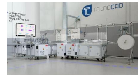
Competence Industry Manufacturing 4.0